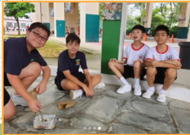
50th Singapore Company in Gan Eng Seng School interacted with the Secondary Ones at their CCA trials for 2024 recruitment