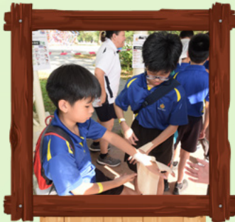
Boys applying their first aid knowledge and skills at one of the stations