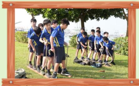
Boys participating in the Trolley station where they were challenged to bring all the scattered balls back to the starting line while ensuring that their feet were on the plank