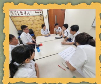
Officers brainstorming on the group discussion activity where they were given case studies to explore