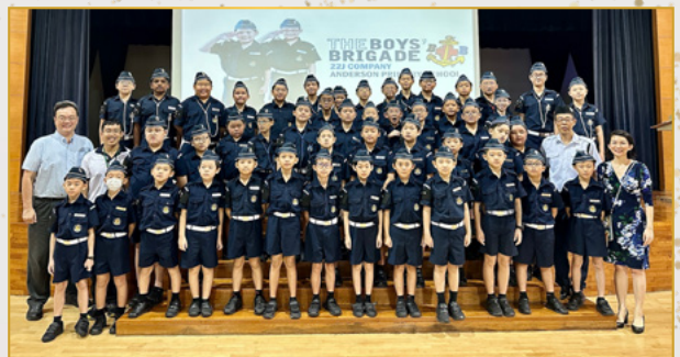
22J Singapore Company with the School Leaders and BB teachers