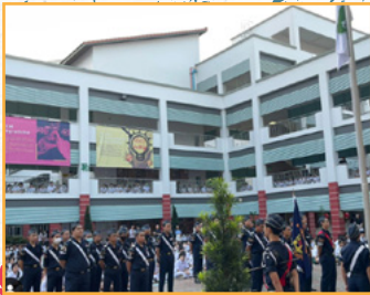
48th Singapore Company in Zhonghua Secondary School forming a parade during morning assembly during BB Day

Lastly, the March holidays provided Companies with the opportunity to organise camps! 36th Singapore Company in Compassvale Secondary School organised outdoor cooking and night hike while 93rd Singapore Company in Yuying Secondary School organised archery and cycling. Other Companies such as 87th Singapore Company in Northbrooks Secondary School even organised basha tent-making and kayaking activities! What an adventure for the Boys!