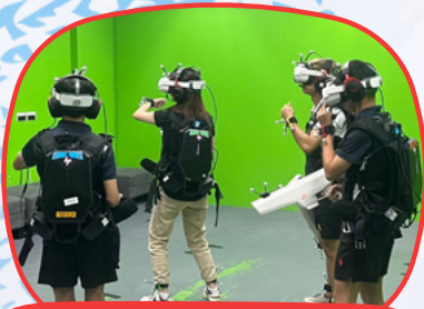
VR (Virtual Reality) gameplay sessions