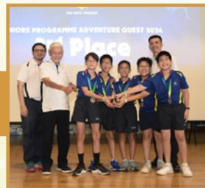
Winning Team 65 (3rd Place) from 42J Singapore Company in Nanyang Primary School