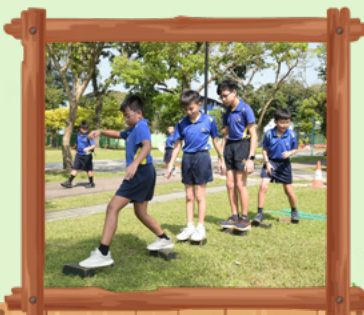
Boys participating in Bridge Too Far station where they were challenged to transport all team members from point A to point B, using only wooden planks and bricks without touching the ground