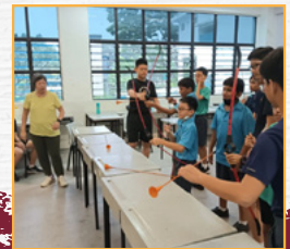
31st Singapore Company in Bowen Secondary School engaging the Secondary Ones through indoor archery for 2024 recruitment