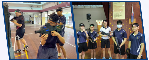
Laser Tag adventures

Then there is Laser Tag. It is not merely about running around and tagging opponents; it is about strategic planning and lightning-fast reflexes. It provides a holistic workout for both the body and mind. However, let us not overlook the quieter, more contemplative activities like Pottery and Art Jamming. These sessions allow Boys to unleash their creativity and express themselves freely. There is an indescribable therapeutic quality to moulding clay or painting on a canvas.