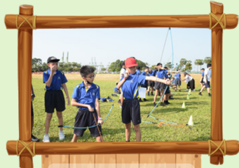
Boys participating in the Archery Target Shoot station