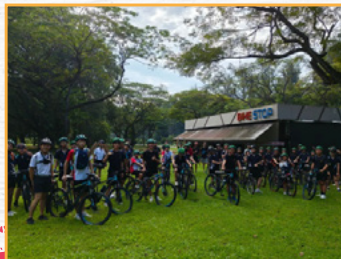
93rd Singapore Company in Yuying Secondary School organised cycling as one of their March holiday camp activities