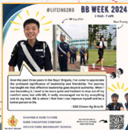
62nd Singapore Company in Orchard Park Secondary School sharing a testimonial in appeal for BB Week