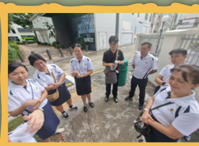
Officers visiting the old Elections Department of Singapore which was one of the stations in the BB Founder's Trail