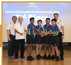
Winning Team 48 (2nd place) from 80J Singapore Company in Farrer Park Primary School