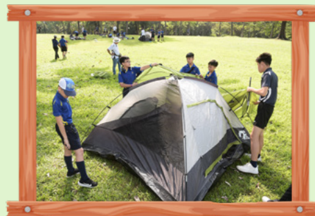
Boys participating in Tent-Pitching station