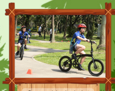
Boys participating in the Bicycle Challenge Course