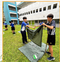
87th Singapore Company in Northbrooks Secondary School organised basha tent-making as one of their March holiday camp activities